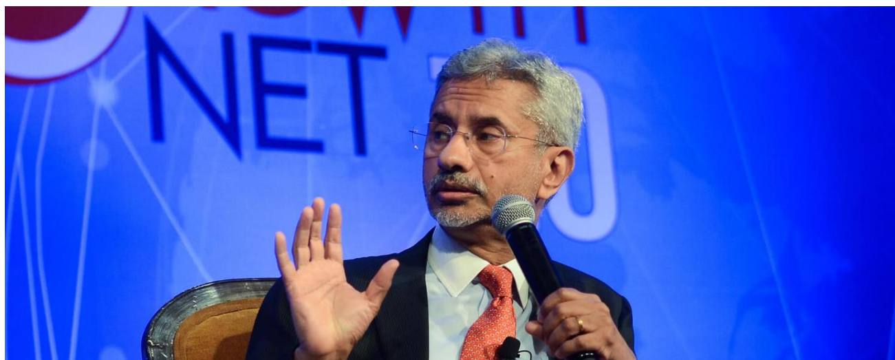
Minister of External Affairs S Jaishankar during the 7th Growth Net Summit in New Delhi.

Our second choice is an article by our chief strategy officer on the hypocrisy of Western media in its coverage of India's foreign policy on the Russia-Ukraine War.