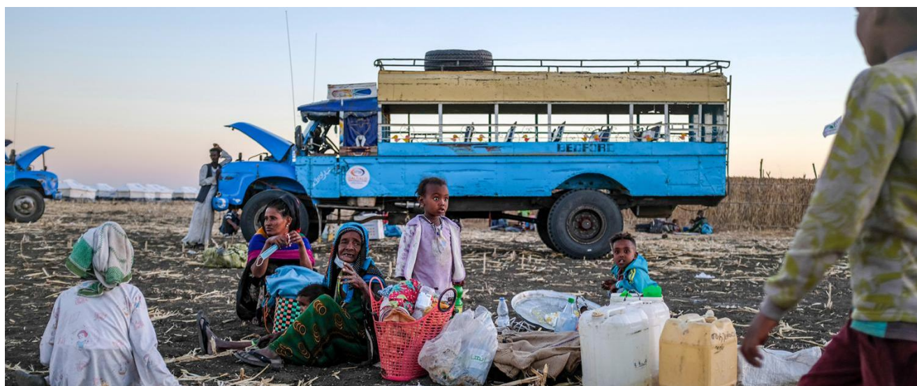
An Ethiopian refugee family waiting for help

Our third choice is an interview of the former head of the Africa desk for the BBC World Service. He shines the light on the Tigray War in Ethiopia, which has not received much coverage in contrast to the Russia-Ukraine War.