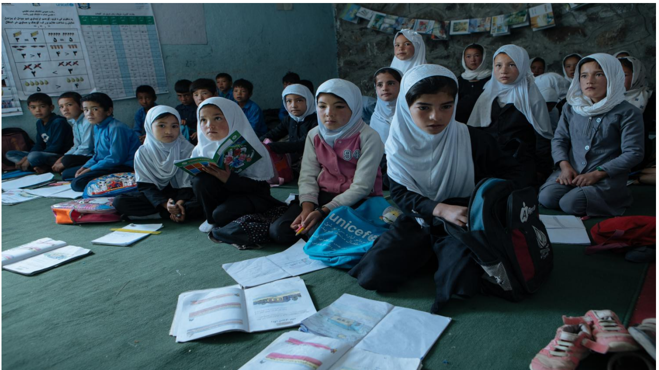
Afghan girls attend school in Herat, Afghanistan, 2019

Our top choice is a letter to the United Nations. We were the only media organization in the world news space that published this letter on the request of our friends from Afghanistan. We turned this piece overnight with team members in the US, the UK and India working together to put it up online.